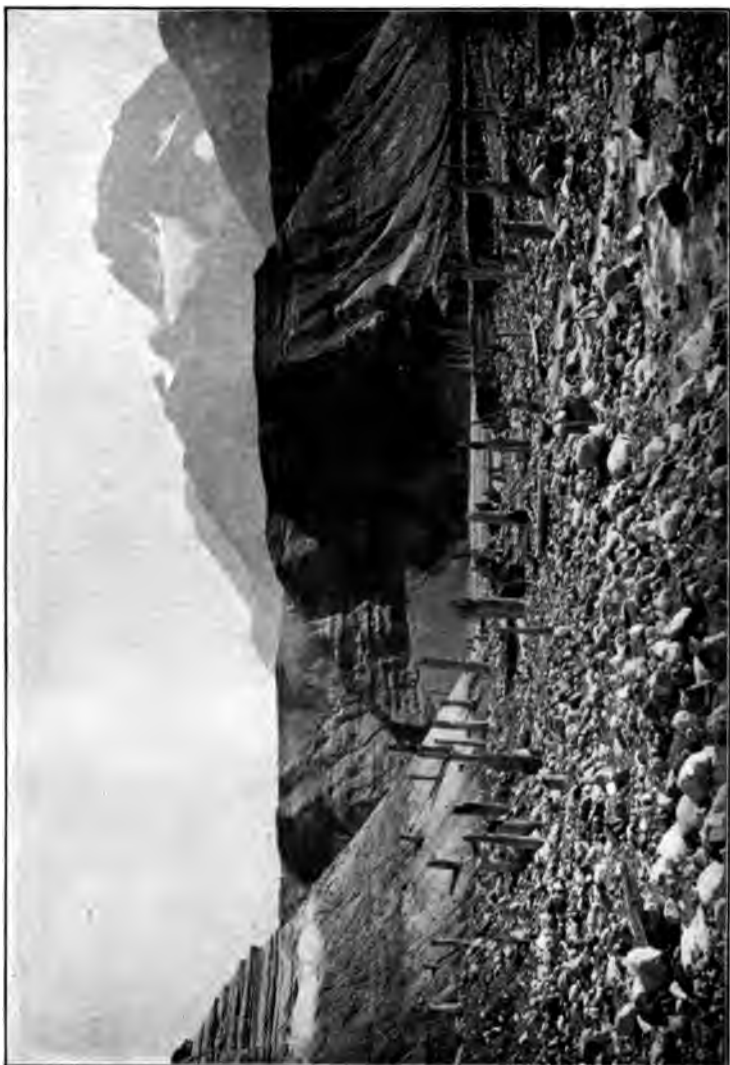
RUINS OF BURIED FOREST, EAST SIDE OF MUIR GLACIER